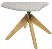
1098 wooden spider leg rotatable oiled oak (at surcharge)