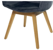
1096 Wooden frame Oiled oak (against surcharge)