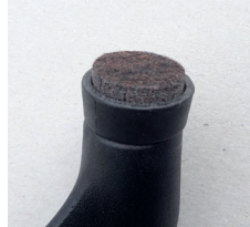
felt glider (at surcharge)