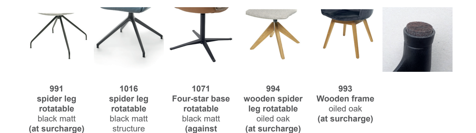
The spider feet no. 991 / 994 / 1016 can be rotated 360°. The four-star foot no. 1071 can be rotated 360°.

The black matt metal base no. 1073 is only available for the bar chairs! The matt black metal base no. 1113 is only available for the bar chairs!