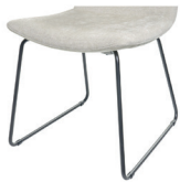
1095 Metal frame black matt standard