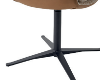
1071 Four-star base rotatable black matt (against surcharge)