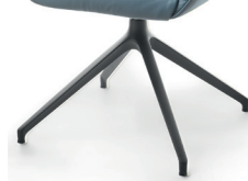
1016 spider leg rotatable black matt structure (at surcharge)