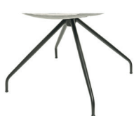
991 spider leg rotatable black matt (at surcharge)