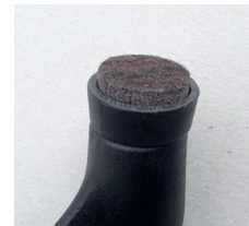
felt glider (at surcharge)