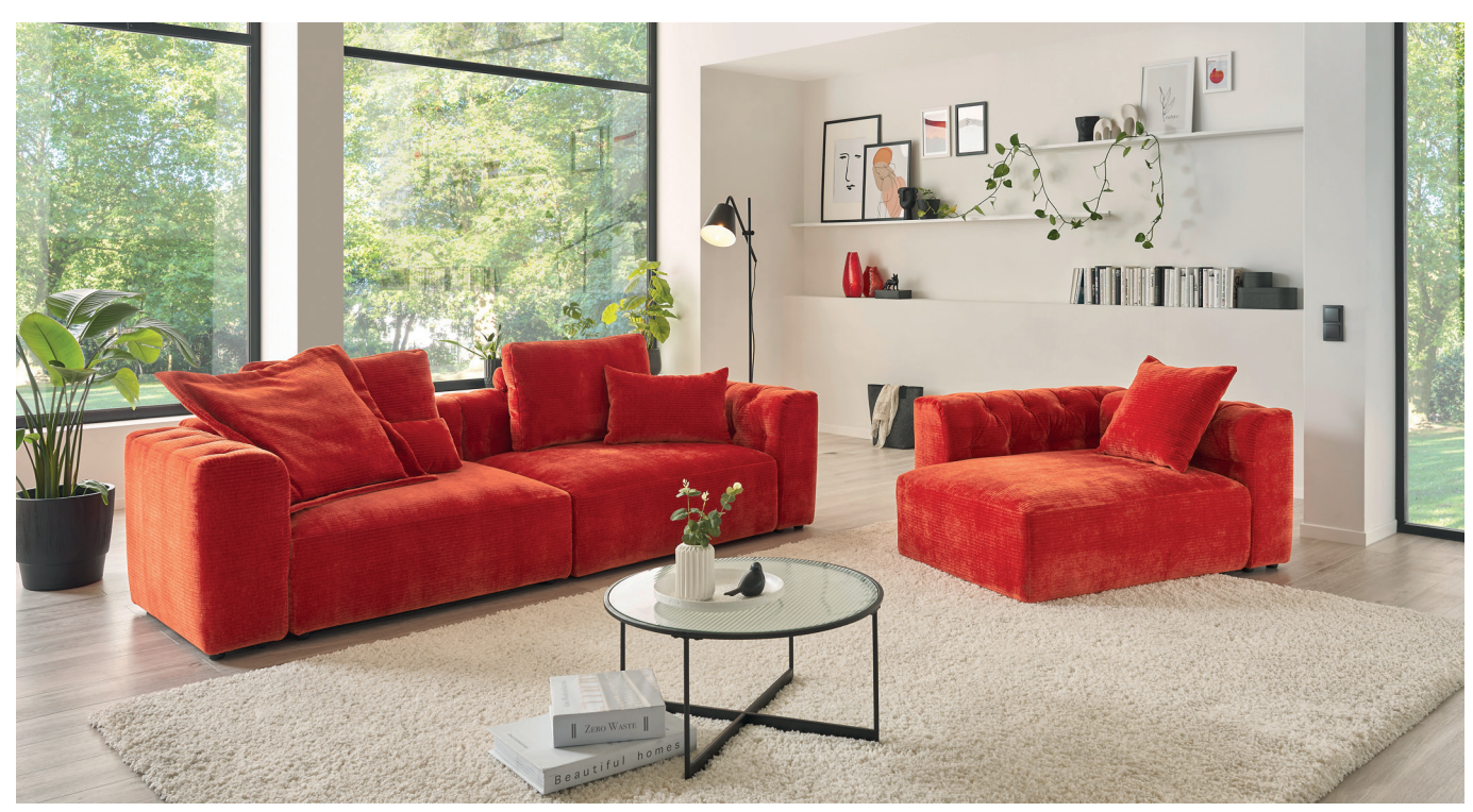
2x base element + 2x side element medium - + 2x side element / 1x base element + 1x side element medium - 1x side element