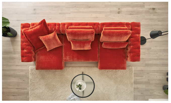
3x base element + 2x side element medium + 3x side element