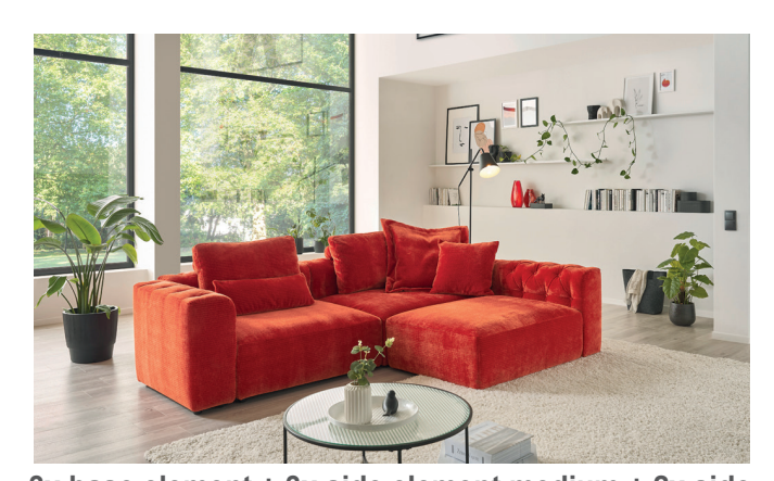
3x base element + 3x side element medium + 2x side element